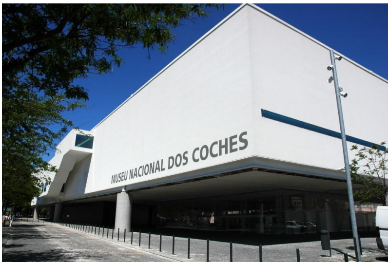
Museu Nacional dos Coches Av. da Índia 136, 1300-300 Lisboa